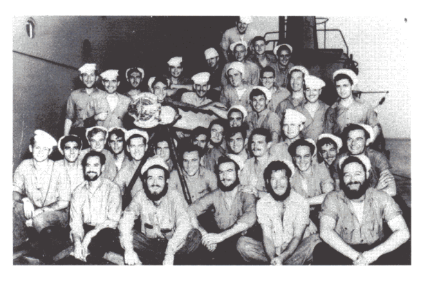
PAMPANITO crew during a refit period between war patrols.

PAMPANITO went on to make three more successful patrols during the war before being retired from active service. Following the war she served as a training ship for the Naval Reserve and was eventually transferred to The National Maritime Museum Association for public display. We are proud to offer the unique experience of a WW II submarine tour to the public as a lasting memorial to the Submarine Service of the US Navy.