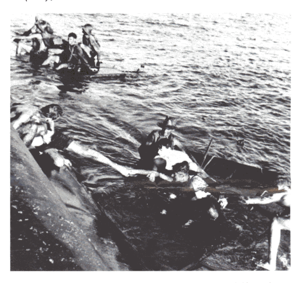
Allied POWs are pulled from makeshift rafts in the South China Sea, September 15, 1944.